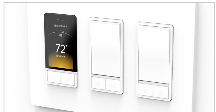
KTAC wireless thermostat control.